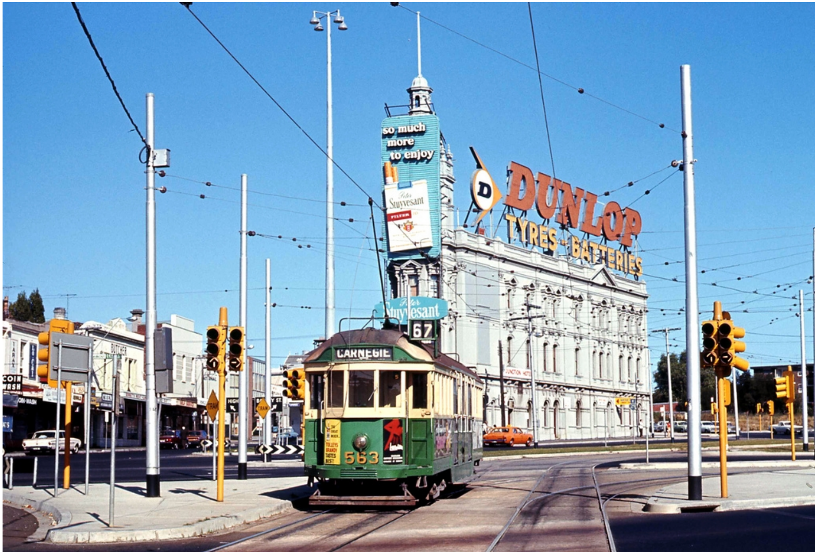
'Melbourne and Metropolitan Tramways Board W2 class tram 563 on Route 67'